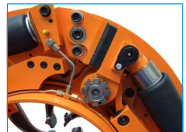
Example of Air Bag on a Cambio 45 Debarker fitted with AirTen Rotor.

The new Air-Ten rotors can be retro-fitted into existing Cambio Debarkers. This can be done easily over a weekend.