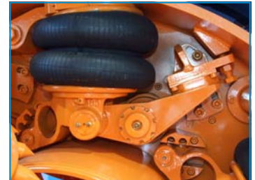
Example of Air Bag on a Cambio 66 Debarker fitted with AirTen Rotor.